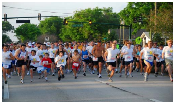
Runners hit the pavement to help benefit PTC in St. Mary Magdalene's annual 5k race.

Thank you to St. Mary Magdalene Parish and all who participated in this year's run! Each dollar for